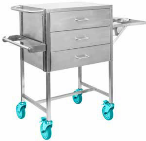
125mm stainless steel castors, including 2 total locking For easy maneuvering