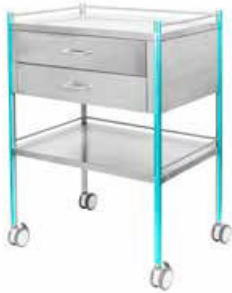
Rounded corners — minimise impact damage