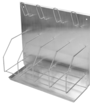
4 bottles rack JT009