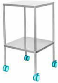
75mm twin braking castors medical design