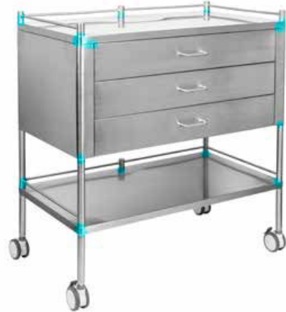
Anti-bacterial Fully welded joints leaving no crevasse to harbour infection