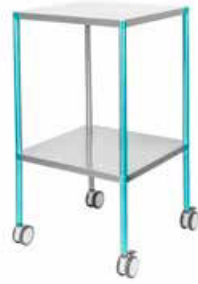
Rounded corners — minimise impact damage