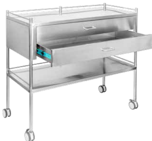
Soft close drawer runners