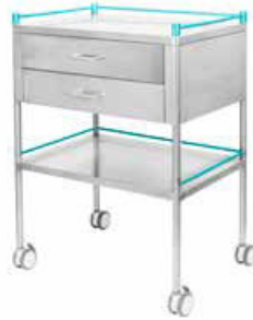
Rails on shelves 3 sides