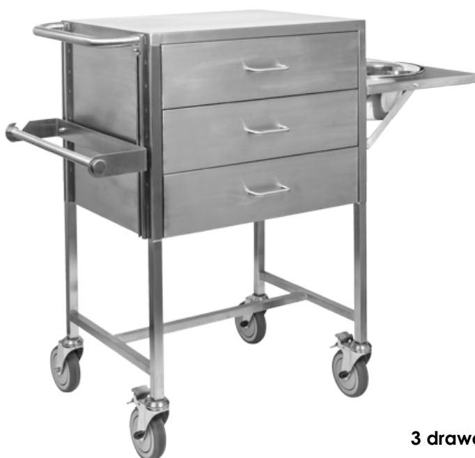
3 drawers JT3063