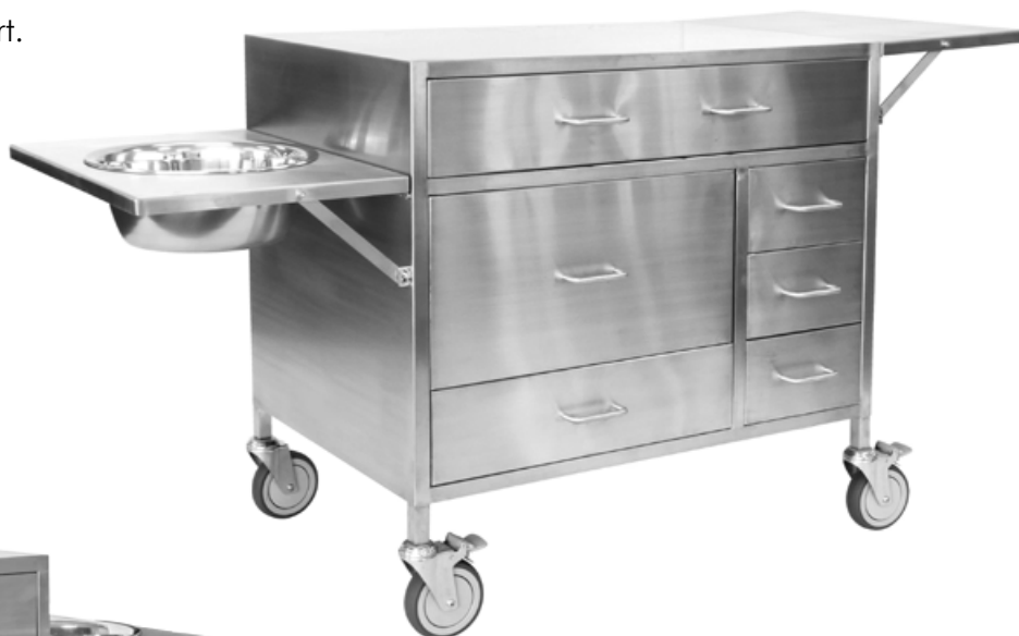
6 drawers JT6093