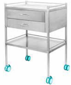
75mm twin braking castors medical design