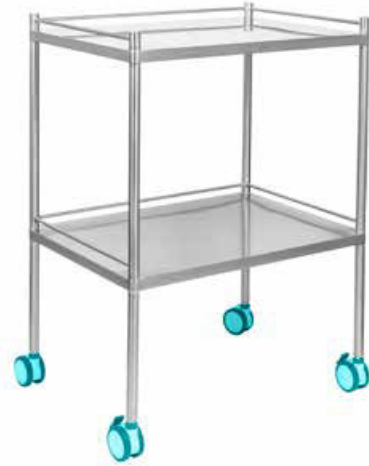
75mm twin braking castors Medical design