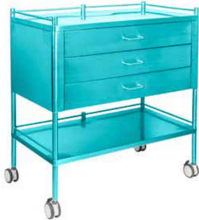
Material grade 304 stainless steel